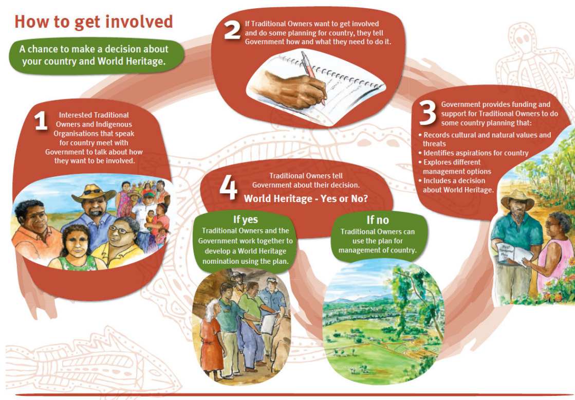
Figure 2. Communication material describing country based planning approach

legislative arrangements. Funding and other assistance is being made available to Traditional Owner groups to engage in this process through the preparation of a plan for their country or other preferred methodology (see Figure 2).