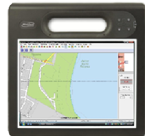
Figure 1: An example of a ruggedised tablet.

With advances in mobile phone and tablet technology SLSA saw an opportunity. So called 'smart phones' became commonplace and the capability and power of these devices increased significantly in a very short period of time. Features that once required multiple pieces of technology were now available in a single handheld device. Features such as: