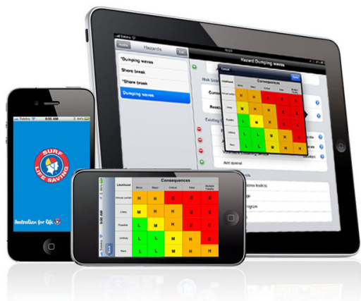
Figure 2: SLSA's suite of risk management tools for iPhone and iPad.

Risk management is a key element of the strategies to reduce injury and loss of life or other adverse impact in the aquatic environment. It is a central component of the drowning chain and used to identify threats to life and strategies to mitigate those threats in a targeted and effective manner. Surf Life Saving has been providing commercial coastal public safety risk management services to organisations (i.e. Local Government) for more than a decade. At the same time there has been an increasing requirement for our members to assess and manage risks for events and member activities. Traditionally these assessments have involved complex paper based forms and there has been a wide variation in the quality of assessment being