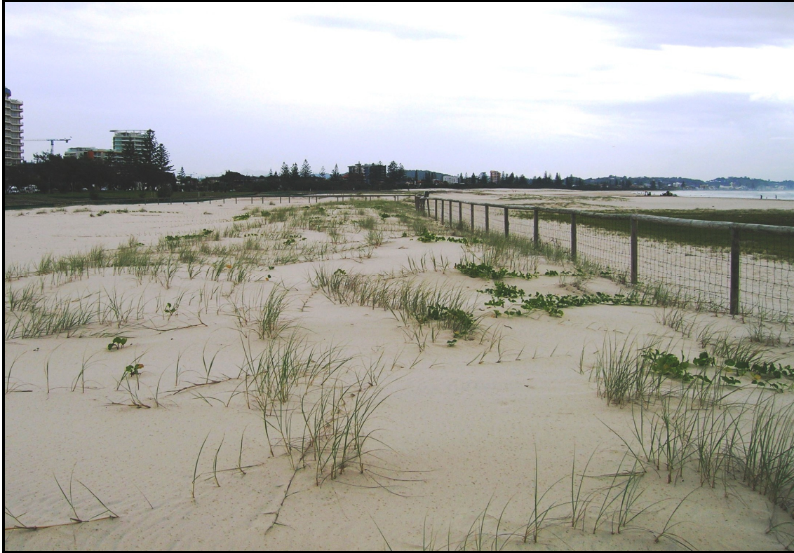
Figure 4 Plant Establishment at 52 weeks Area A

At 12 months after the planting on the foredune, Beach Spinifex ( Spinifex sericeus ) densities are approaching, or in some areas have reached, densities expected for a naturally established frontal dune (Fig 4).