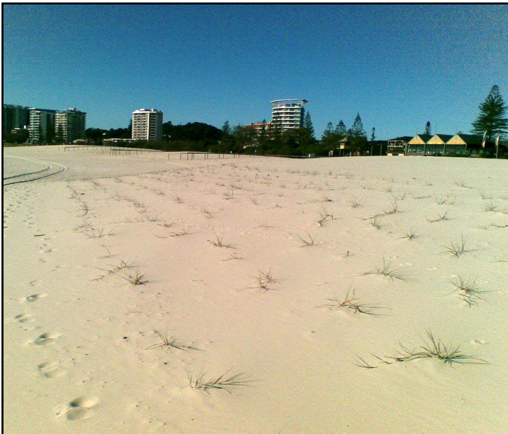
Figure 3 Plant Establishment at 12 weeks Area B

Planting survival rates varied across the site due mainly to mobile sand and anthropogenic disturbance. Good rainfall during the installation period and for four weeks following the planting helped with the successful establishment of the plants (Figure 3).