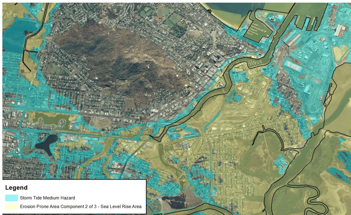
Photo 1: Areas of Townsville at risk from sea-level rise to 2100 and storm-tide inundation.

Coastal hazard areas have been defined throughout Queensland by erosion prone area plans declared by the state government and storm-tide inundation studies undertaken by most local governments. In both cases, projected sea-level rise and an increase in cyclone intensity to 2100 have been built into the hazard assessments. Sea-level rise in particular can significantly extend the areas at risk from coastal hazards. Like other major coastal towns, the problem is large in Townsville where 4400 properties are at risk from a future sea-level rise of 0.8m with 2830 of those located in South Townsville.